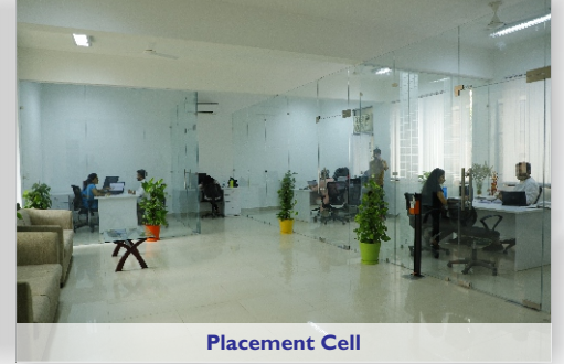
Lloyd Institute of Forensic Science Campus